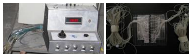
Figure 1. Pressure tapping's configuration

cm, and the lowest air outflow velocity without causing fluctuations at the exit is 34 m/s. In addition, the maximum air outflow velocity is 47 m/s. The ratio of the test length to test height in a range of 1 to 3, while the optimum recommended ratio is about 1.5. To measure the static pressure, 12 holes were created on the suction surface, and 11 holes were created on the pressure surface and were connected to plastic tubes using needles (as shown in Fig. 1).