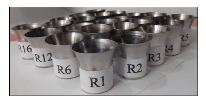
Fig. 2. Some of the formed samples