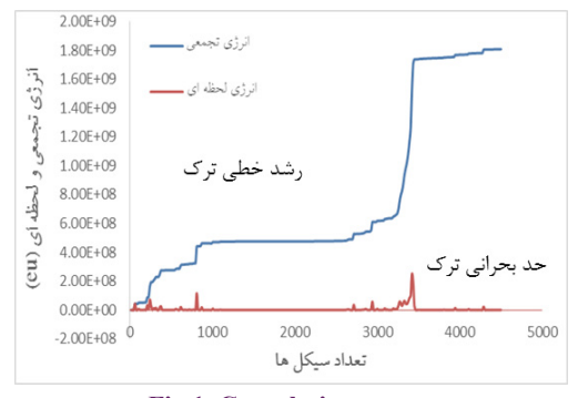
Fig 1. Cumulative energy

After performing the fatigue tests on the samples prepared in different ratio of loads and thicknesses and measuring the amount of released acoustic energy, two important parameters, cumulative energy and cumulative count, were obtained to determine the relationship between the cracks length and the energy of acoustic emission. The results are presented in following. One of the important parameters that can be used in analyzing the crack length in a piece is the cumulative energy. This parameter is equal to all the released energies up to the moment. The value of this parameter for one sample is shown in Fig. 1.