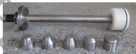
Fig. 1. The examined cushions (from right-to-left): cylindrical, conical, sagittal, parabolic and double conical.

To pump the hydraulic oil inside the cylinder, a 120 bar power package has been used. In order to measure the mechanical movement of piston and the effect of weight and the cushion geometry on the piston motion, cushions have been tested under two separate load of 200 and 350 kg. Cylinder movements have been recorded by a 30 frames/s