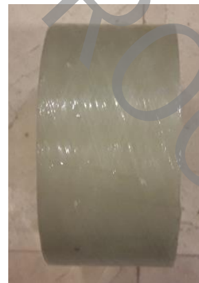
Fig. 1. Cylindrical sample

In order to conduct a pressure test between two parallel rigid plates, the test conditions were determined according to ASTM D2412-02 standard. In Fig. 2, the device is shown after the installation of rigid plates. It is worth noting that the size of the sample tested is chosen so that the composite cylinders examined are short tubes [1].