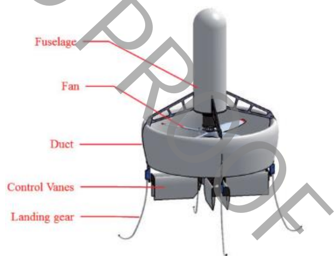
Fig. 1. ducted fan details

The used optimization method is the Particle Swarm Optimization (PSO) algorithm, the search domain of the optimization parameters is extracted from the initial