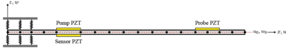
Fig. 1 Beam geometry with elastic foundation