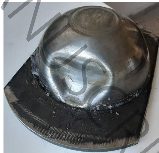
Figure 2 final collapsed vessel