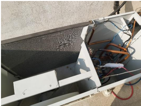
Fig. 2. Microchannel condenser used in the experiment