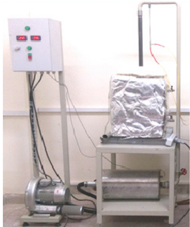
Fig. 1. Experimental apparatus

Corresponding author, E-mail: rajabi@semnan.ac.ir