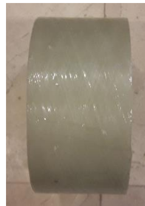
Fig. 1. Cylindrical sample

In order to conduct a pressure test between two parallel rigid plates, the test conditions were determined according to ASTM D2412-02 standard. In Fig. 2, the device is shown after the installation of rigid plates. It is worth noting that the size of the sample tested is chosen so that the composite cylinders examined are short tubes [1].