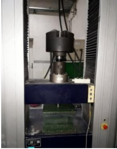
Fig. 2. Geometry and dimensions of the stretch test sample