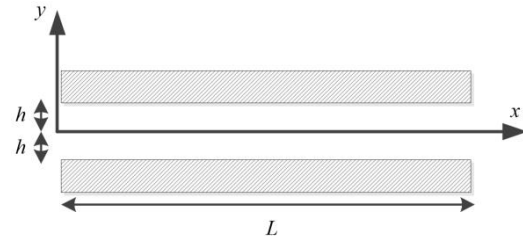
Fig. 1. Two-dimensional geometry of the microchannel

*Corresponding author's email: ahmadi@eng.sku.ac.ir