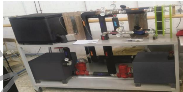
Figure 1. Laboratory setup

Figure 1 shows the prepared setup which consists of two hot and cold loop with a fluid storage tank, a pump, a section for measuring pressure and temperature (before and after the exchanger), and a section for measuring fluid flow rate. A U-shaped manometer is also installed in the setup to measure the pressure drop. Also in the hot section, there are two heating elements equipped with a thermostat and a cooling system has been used in the path of the cold fluid and before the cold fluid storage source. The thermophysical properties can be calculated according to the bulk temperatures of the two fluids at the inlet and outlet of the heat exchanger. By recorded flow rates and thermophysical properties, the heat transfer rate and the total heat transfer coefficient are calculated. By obtaining the friction factors, the pressure drop for the path and inlets (ports) is achieved. The total pressure drop is two paths of inlet and outlet pressure [6]. Thermal effectiveness or the ratio of actual heat transfer to the maximum was calculated [7]. Efficiency was also calculated Equation (1). In order for the use of nanofluids to be economically viable, the ratio of heat transfer coefficient to the pumping power in both nanofluids and water must be more than one [8].