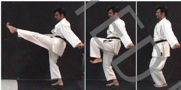
Figure 2. A professional athlete is doing KARATE- MAE GERI

In this way, the user can use this environment to observe momentary changes in the joint variables and mechanical parts in the model. It is not necessary to obtain mathematical model and differential equations to define the system, the software creates the mathematical model after describing the geometry and the characteristics of the mechanical elements. In this simulation, body limbs are introduced as rigid links according to human body structure. To simulate the movement, a designed module is installed on the athlete's body. An act is asked to perform by Karate athlete that it called KARATE- MAE GERI. After performing the movement, these modules are connected to computer to extract the obtained information to simulate the movement. Figure 2 shows how to perform this movement correctly in three steps by a professional athlete, and Figure 3 shows a simulated model of this movement.